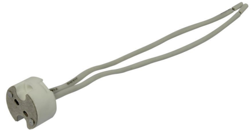
GX5.3 (12V) Socket